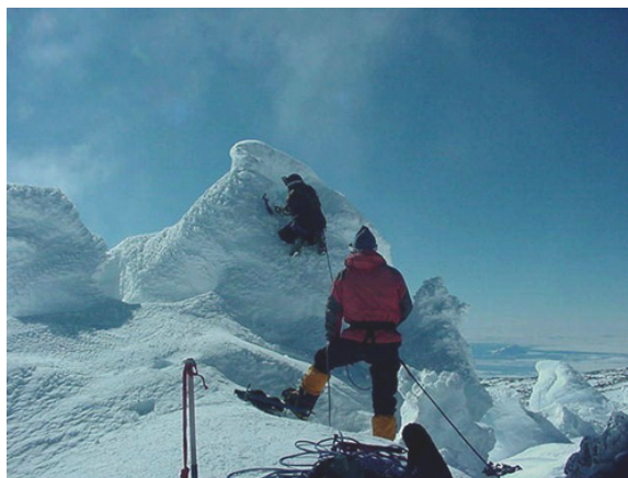
Figure 2: Climbing to the chimney entrance of an ice-tower.