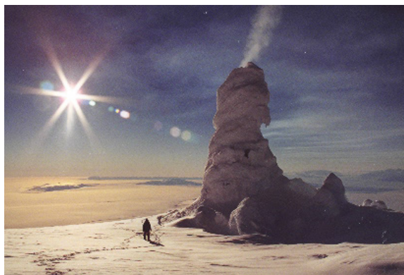
Figure 1: A steaming fumarole on Mount Erebus with a 10m ice-tower precipitated from H 2 O-rich volcanic gas

References: [1] Malin, M.C. and Edgett, K.S. (2000) Science , 288 , 2330-2335. [2] Ferris, J.C. et al. (2002) AGU Fall Mtg. , #0363. [3] Hecht, M.H. (2002) Icarus 156 , 373-386. [4] Musselwhite et al. (2001) GRL , 28 , 1283-1286. [5] Hoffman, N. (2002) Astrobiology , 2 , 313-323. [6] Lee, P. et al. (2001) LPS XXXII , Abstract #1809. [7] Costard, F. et al. (2001) Science , 295 , 110-113. [8] Hartmann, W.K. et al. (2000) BAAS , 32 , 5802. [9] Clifford, S. M. (1993) JGR , 98 (E6) 10973-11016 [10] Kyle, P.R., et al, (1990). GRL 17 , 2125-2128