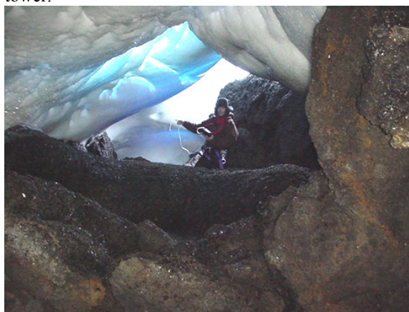
Figure 3: Inside the grotto below an ice-tower. Note the bare, dry rock underfoot and the filtered light.